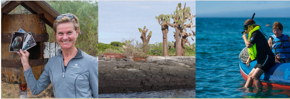
Post Office Bay, Floreana Island