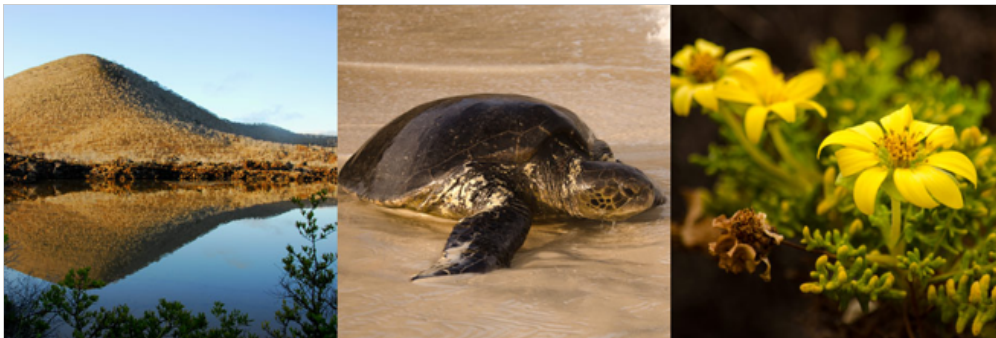
Cormorant Point, Floreana Island

Cormorant Point hosts a large flamingo lagoon where other birds such as common stilts and white-cheeked pintails can also be seen. The beaches on this island are distinct: The Green Beach is named so due to its green color, which comes from a high percentage of olivine crystals in the sand, and the Flour Sand Beach is composed of white coral.