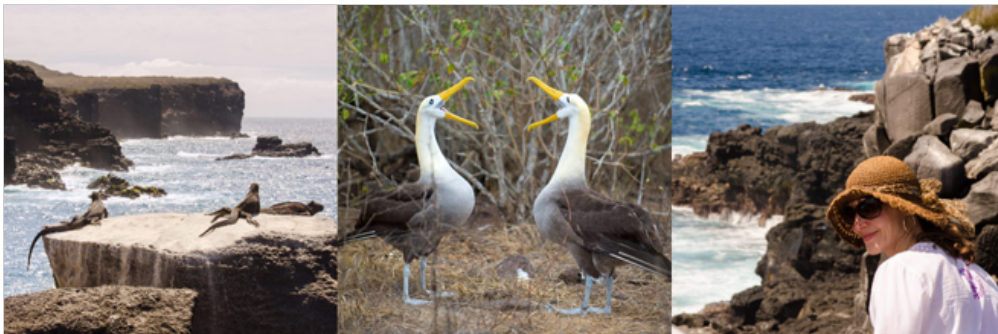
Suarez Point, Española Island

On the trail to Suarez Point you will have the chance to spot blue-footed boobies, albatrosses, and Nazca boobies. This island is the breeding site of nearly all of the world's 12,000 pairs of waved albatrosses. You will also visit a beautiful site on the ocean front where there is a cliff that the large albatrosses use as a launching pad! You will have the chance to see the famous blowhole that spurts sea water into the air. The landscape is great for photography.