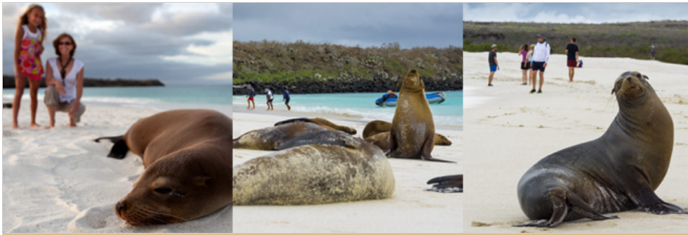
Gardner Bay, Gardner Islet & Osborn Islet, Española Island