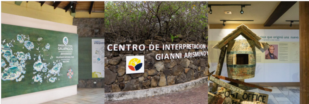
Gianni Arismendy Interpretation Center, San Cristobal Island

This site is part of an environment project. The tour of this center will explore the natural history of the islands including human interaction and conservation efforts. The Museum of Natural History explains the volcanic origin of the archipelago, ocean currents, climate, and the arrival of endemic species. The Human History exhibit chronologically describes significant events such as discovery and colonization of the islands.