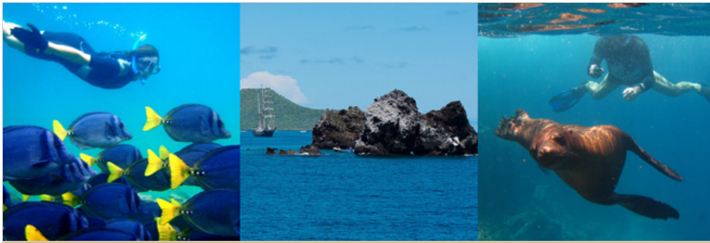
Devil's Crown, Floreana Island