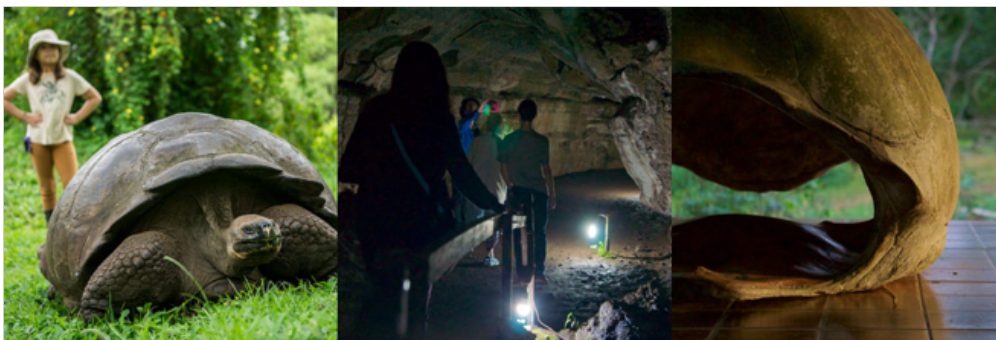
El Chato, Santa Cruz Island

Located about 22 km from Puerto Ayora, the El Chato Reserve is divided into two areas: Caseta and Chato. Visitors typically begin their visit near the highland town of Santa Rosa. The Caseta route offers a more rugged path, while Chato is more accessible. The reserve is an excellent place to observe giant tortoises roaming freely during the dry season, along with other native wildlife like short-eared owls, Darwin's finches, yellow warblers, Galapagos rails, and paint-billed crakes.